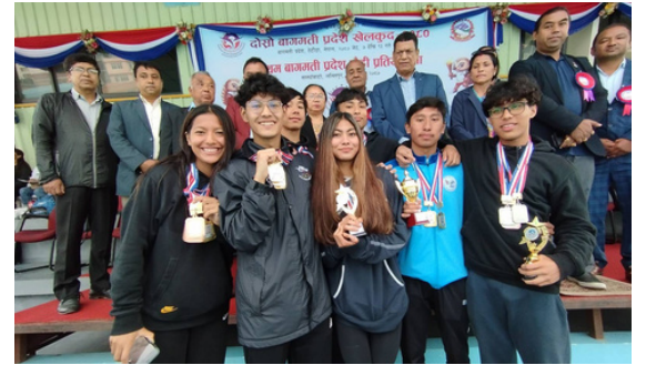
Table Tennis: Tournament Recap: